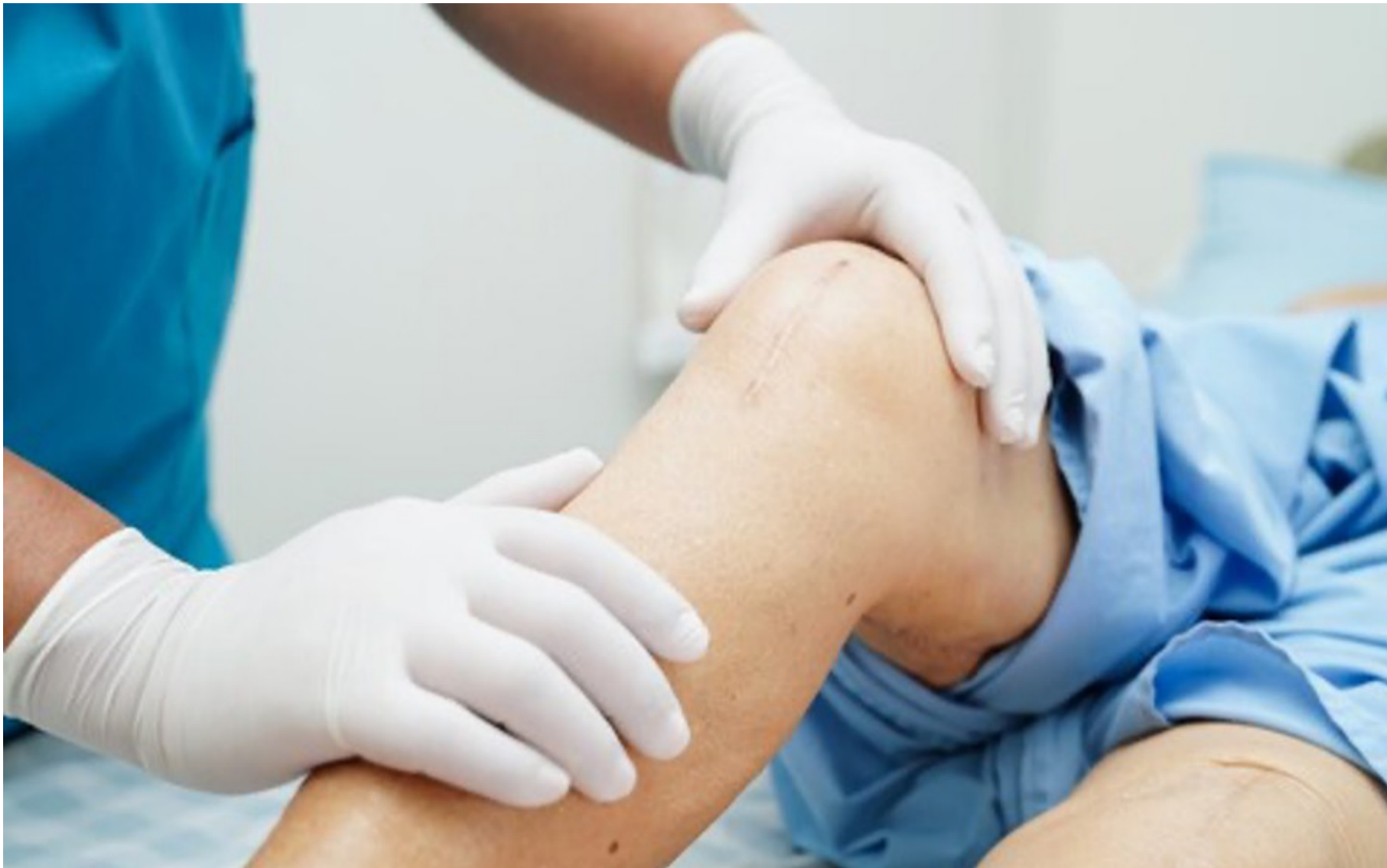
The most common private procedures by number of admissions include both knee replacements and arthroscopies