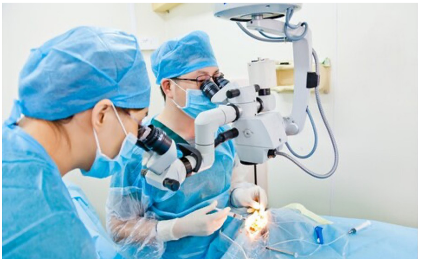
Since Covid, there has been an 84 per cent increase in waiting times at NHS hospitals for cataract surgery

patients, they do help individuals make informed choices for all procedures based on factors like location and facilities, admission numbers, length of stay and patient feedback. PHIN also publishes guides to help patients ask the right sort of questions when researching their treatment plan. You can use their non-biased, non-commercial website to find a specialist for all procedures in your area.